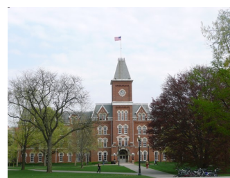
Ohio State University

If you are a self-motivated learner who enjoys meeting new people, and you would like to have a variety of experiences, a large university may be ideal.